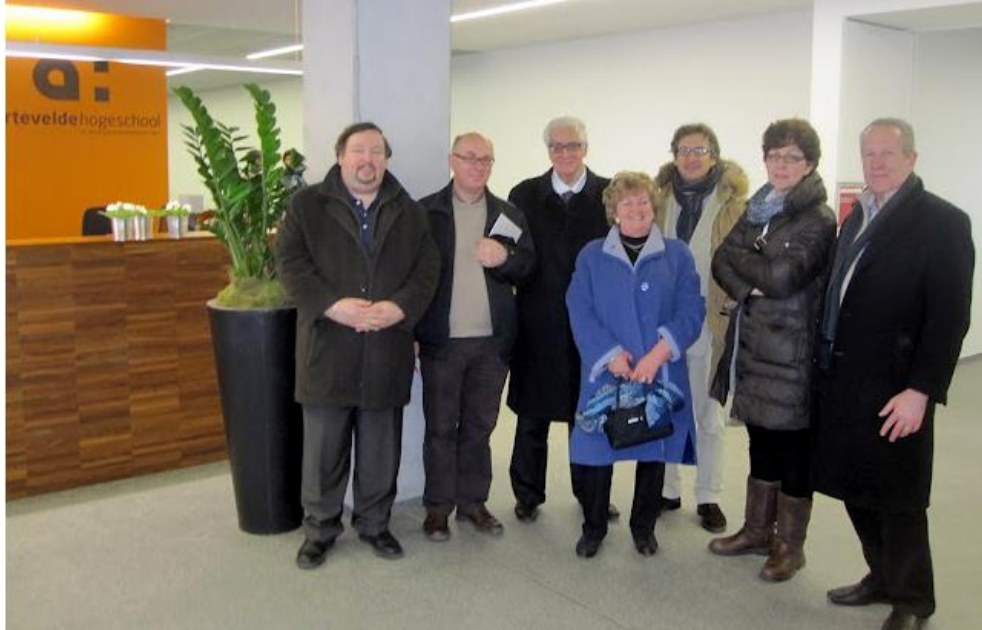
The Board, ready to welcome you in Belgium, Artevelde University College Ghent in 2013!

The campus does not have a big competition hall and the proposal of the organization committee to run the computer competitions in parallel in several rooms is accepted by the Board. Most probably, with the help of wifi cameras, the competition could be followed on big screen outside the rooms.