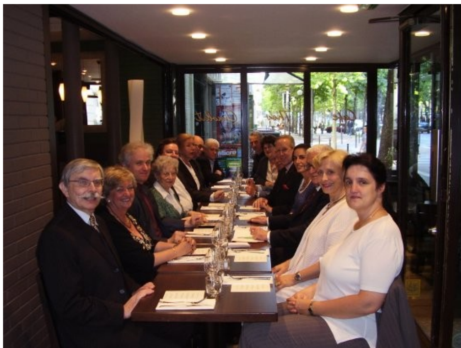
In this photo, all members of the Board and guests, together with a few members of Interinfo France and the Representative of the Tourist Office of Paris.

The Board examined the documents sent in by China and specifically the proposal to set up an education committee. A positive decision was taken. This Committee will be included in the Scientific Committee, and a formal document will be submitted for discussion and approval to the Council members in Beijing. It was agreed that education will be the leitmotiv of the next two years of Intersteno.