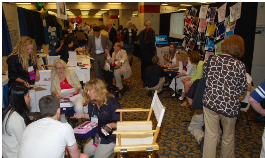
Exhibitions at NCRA 2010