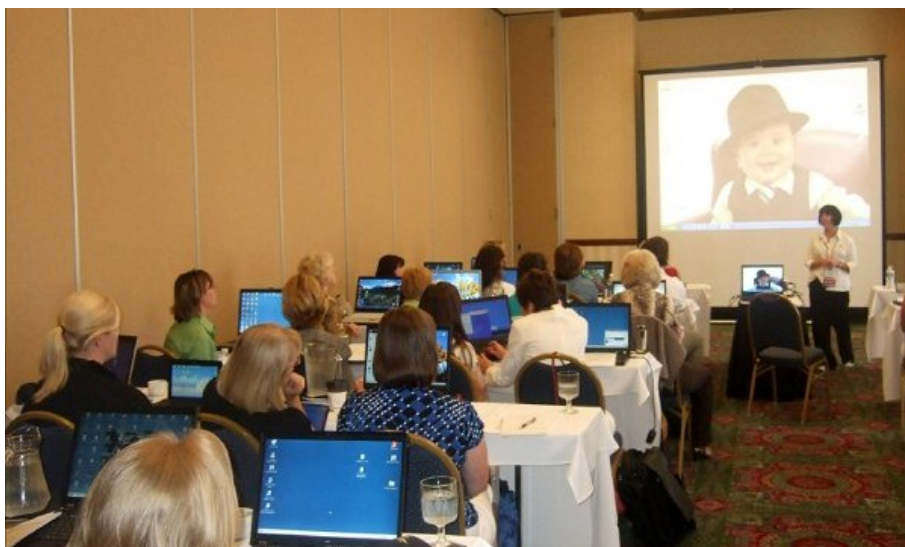
Seminar at NVRA 2010