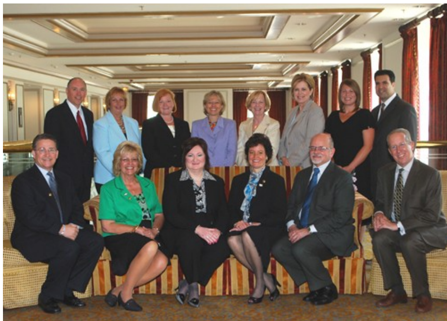
NCRA Board 2010