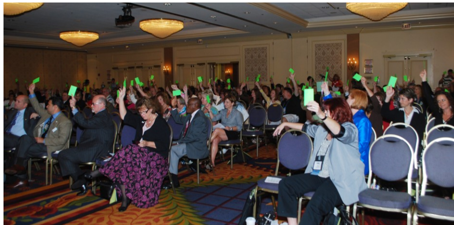
Voting at the NCRA general Assembly 2010

Those attending the Convention received the latest edition of the Intersteno leaflet, which can also be downloaded from the home page of www.intersteno.org .